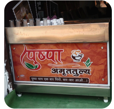
Serving + Cash Counter