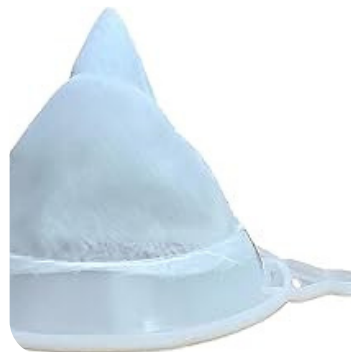
Big Chay Channi