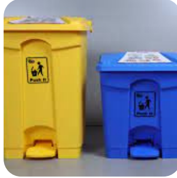
Small & Big Dustbin