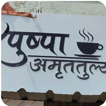
Main Board (Vinyl)